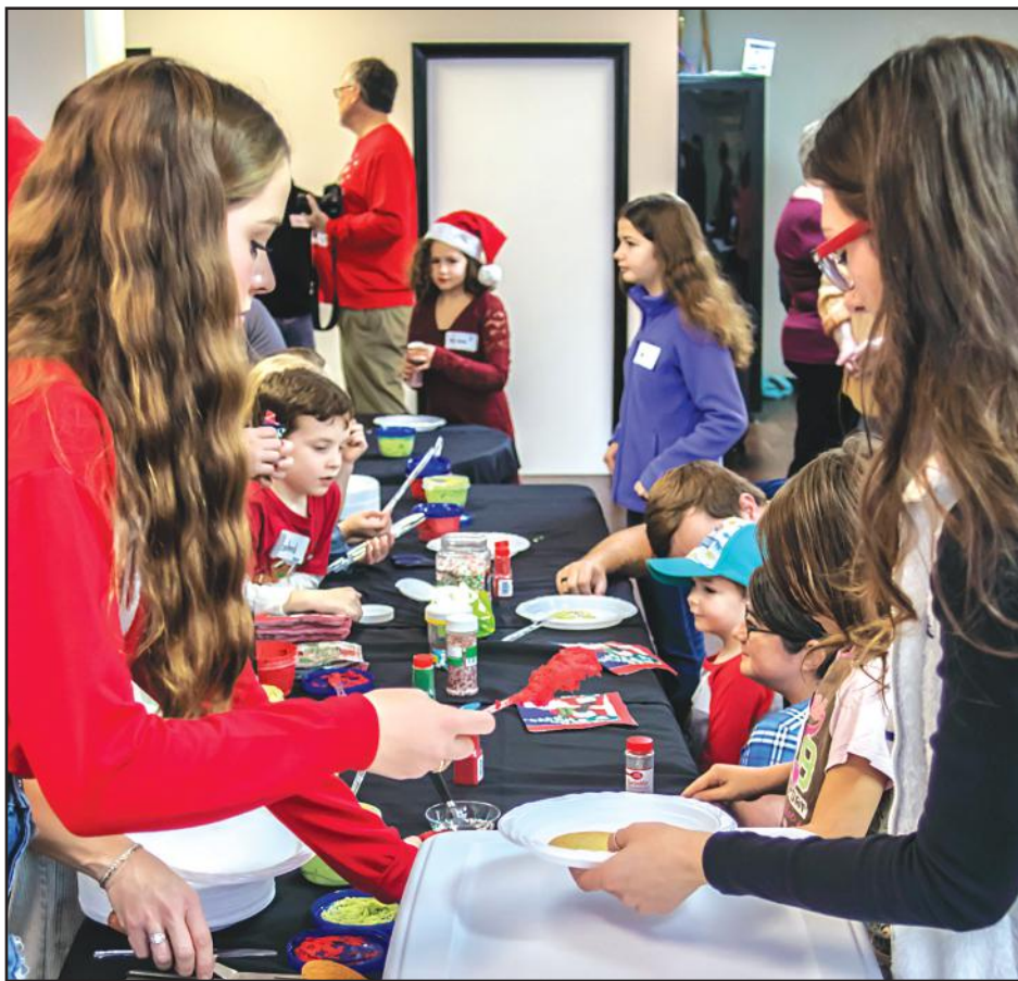
Decorating your own sugar cookies is a fun part of the Christmas season.

we're trying to expand on that every year.