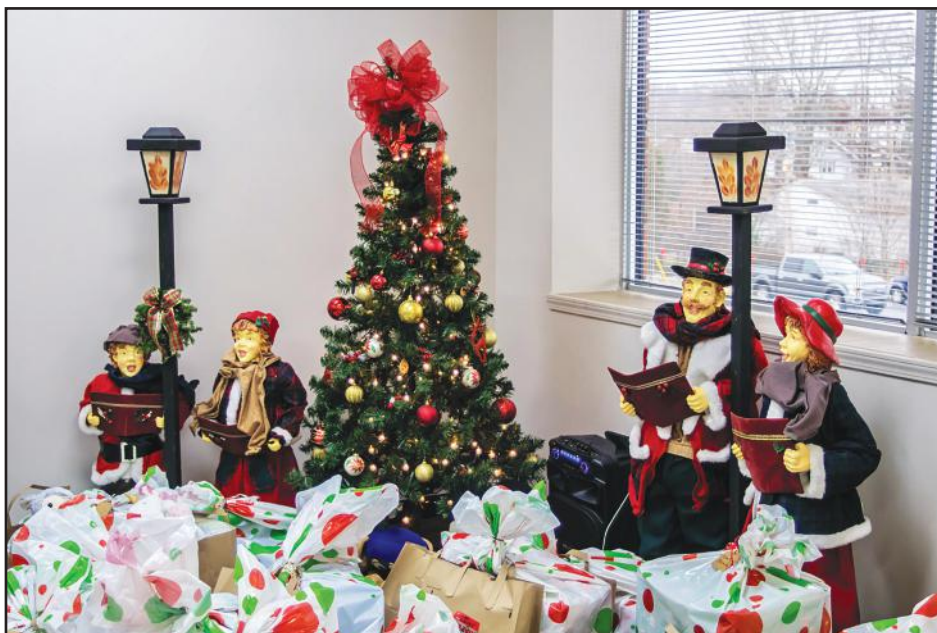
A small sampling of the presents and decorations for this year's Haley Sue Foundation "Merry Little Christmas" party. It was held on December 9 at the Washington Center.